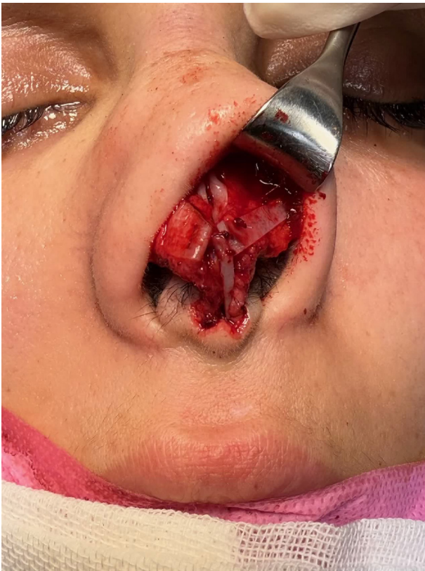
Figure 2: Post Reconstruction

This case emphasizes the critical importance of intraoperative flexibility and surgical preparedness when managing unexpected anatomical findings. Despite thorough preoperative assessment, surgeons must be prepared to modify their surgical plan and harvest additional grafts when confronted with unforeseen anatomical variations. From a clinical practice perspective, we recommend that informed consent discussions for aesthetic Rhinoplasty include the possibility of encountering congenital anomalies that may require cartilage grafting and alteration of the surgical plan. Proper documentation